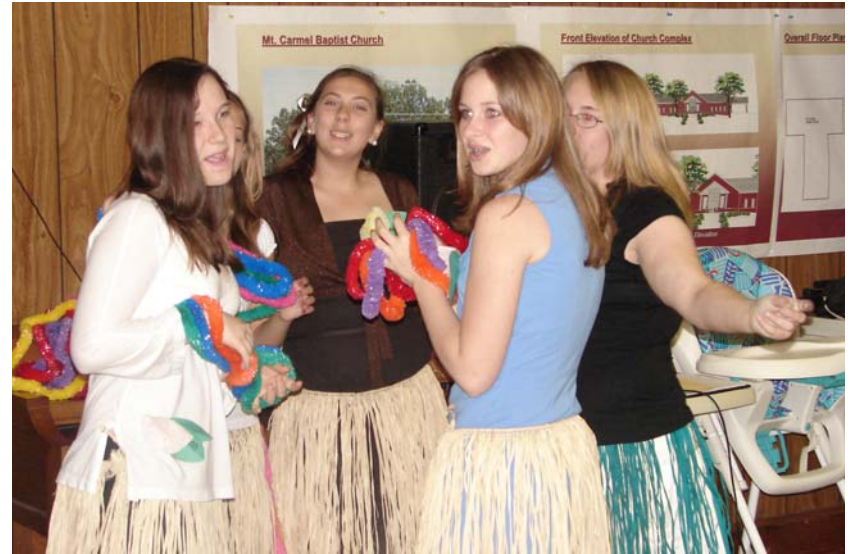
The girls get ready to entertain at Murdoch Day 2006.