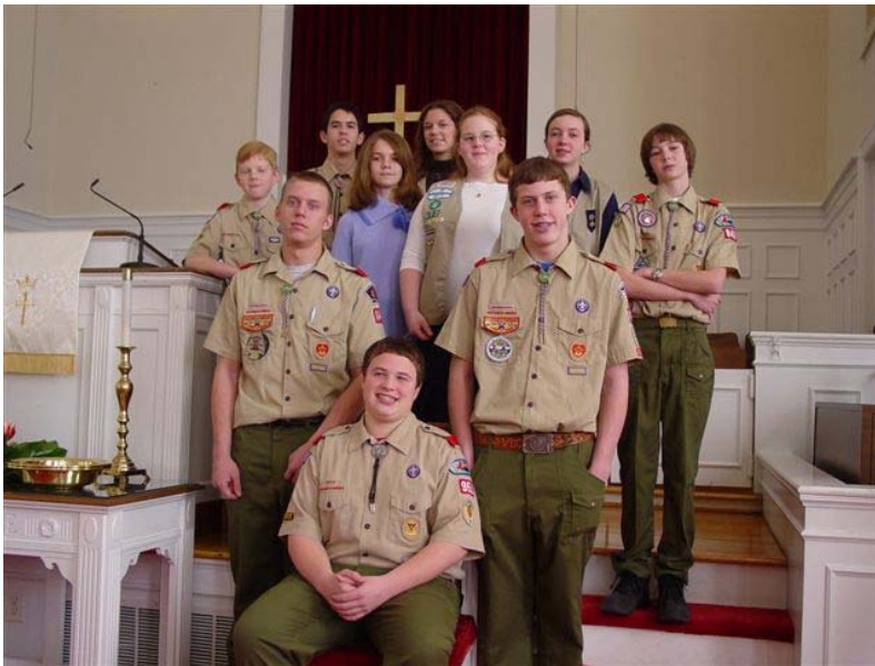
Our Scouts help lead in worship on Scout Sunday 2006.