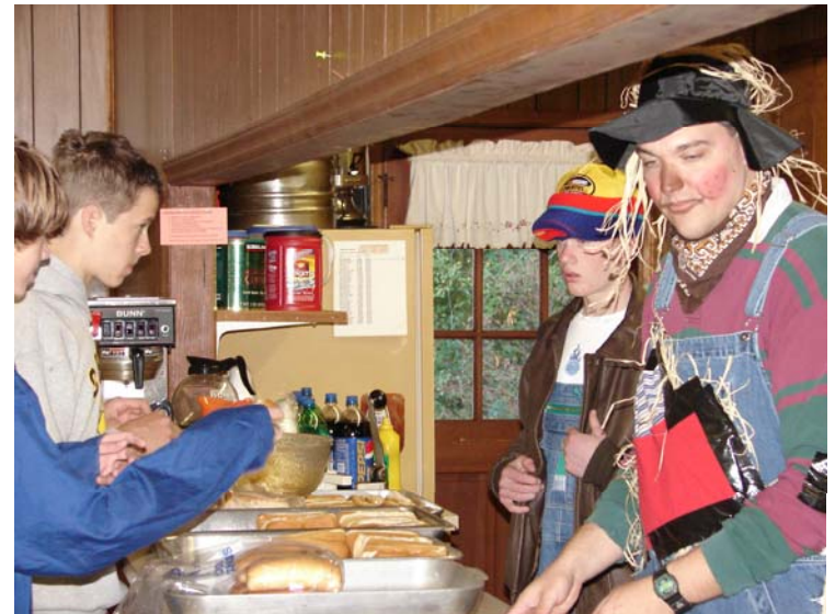
Workin' hard at the hot dog supper!