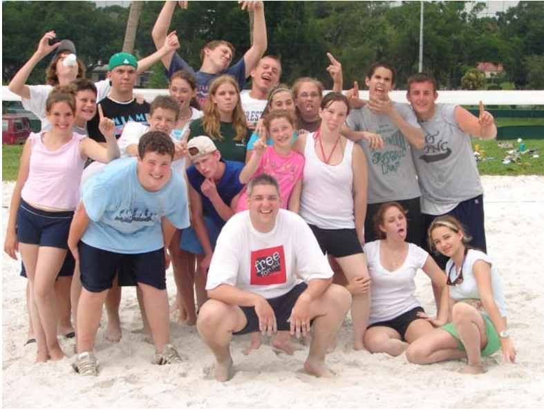
2006 PASSPORT Stetson Volleyball tournament champions!